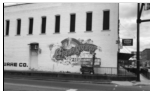
A wider view while still a work in progress - to show the mural's location.